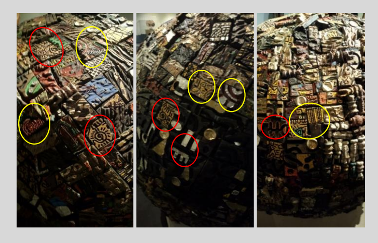
Up-close view of figure 1 showing different Symbols of Uli (in the yellow circles) and Nsibidi (in the red circles).

2. Extensions in concentric coils: agwolagwo (derived from the snake) and double triangles ( mboagu , leopard's claw).