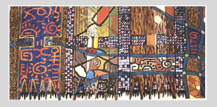
Figure 2. Narrow Way (2013). Mixed media, 38 \times 65 ". Reproduced with permission from Gerald Chukwuma.

Figure 1 is a good representation of his Paintaglio style, with an admixture of other features including images/motifs cast from molten silica which are quite uncommon in his works. These motifs and symbols function as ideograms which resonate with various themes of human identity, race, religion, migration, knowledge, unity, environment, culture and heritage. Chukwuma says, he is "fascinated by motifs and symbols" for the "purposes they served in their times and their historical significance." This justifies why he profusely uses them in his works. As seen on Narrow Way (Figure 2), done in 2013, by engraving these indigenous signs and symbols on wood panels, he demonstrates his skill in handling mechanical manual sculpture tools such as the router, angle grinder, gouges, and others which helps him unveil imageries latent in woods by subtracting non-essentials to create desired shapes, forms, and patterns.